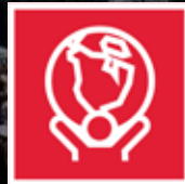
Environment and Fire Safety