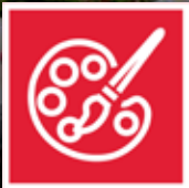
Arts and Culture

As a purpose-driven organization, we value the communities that we are a part of. We support community prosperity in many ways including donations to registered charities, community investments and sponsorships, volunteer efforts of employees, and supplying insulation products.